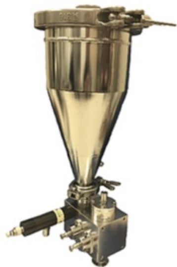
FlexPTS with hopper