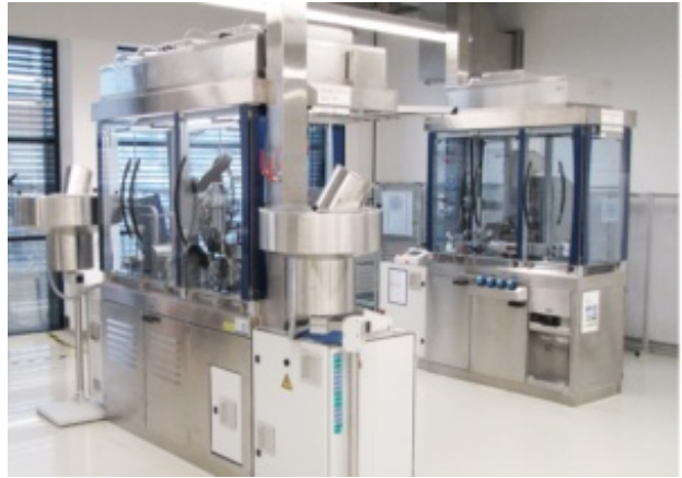
Dec solutions used to construct ultra-high containment filling line