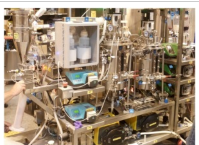
FlexPTS : Microdosing into mini reactors