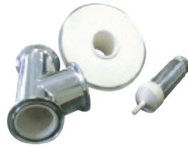
Special inserts for very hard products

Dec makes the jet mills to suit difficult products, with top and bottom exit systems and intermediate cyclones for particle fractionation if required, including vertical milling where appropriate.