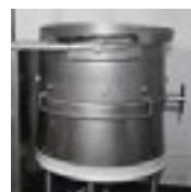
Quick Disconnect Sorting Bowl