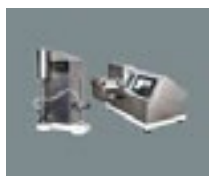
Pair with Filling Machines