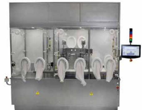
Version 3 - Semi-Automated with oRABS, LAF, Conveyor