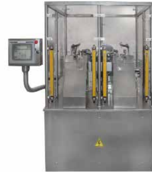
Version 2 - Dual 2-Up